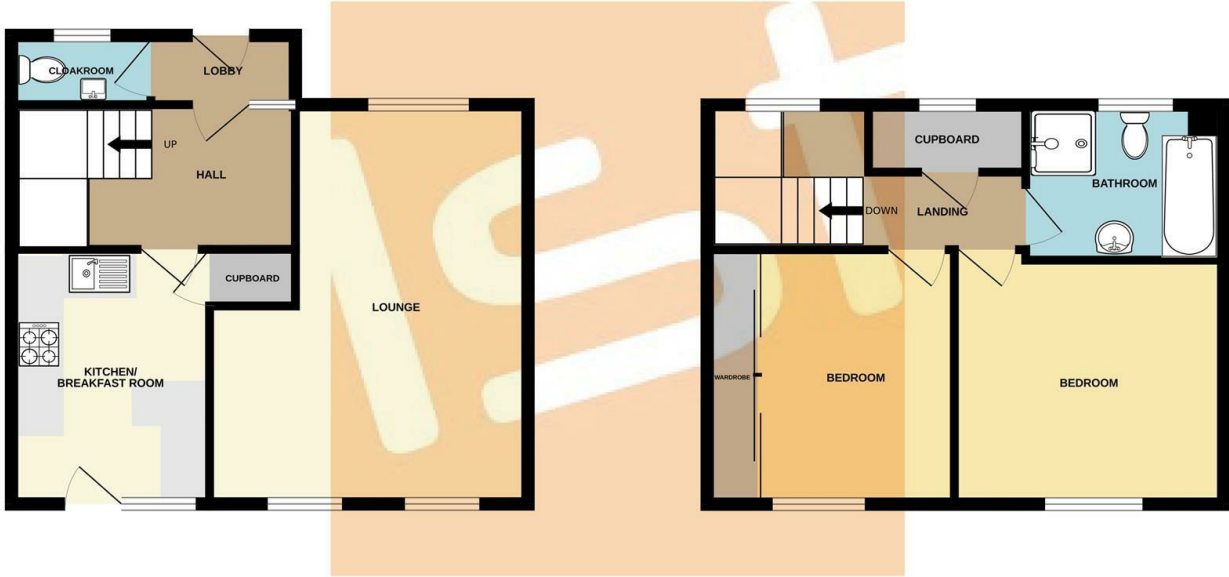
TOTAL FLOOR AREA : 843 sq.ft. (78.3 sq.m.) approx.

Whilst every attempt has been made to ensure the accuracy of the floorplan contained here, measurements of doors, windows, rooms and any other items are approximate and no responsibility is taken for any error, omission or mis-statement. This plan is for illustrative purposes only and should be used as such by any prospective purchaser. The services, systems and appliances shown have not been tested and no guarantee as to their operability or efficiency can be given. Made with Metropix ©2026